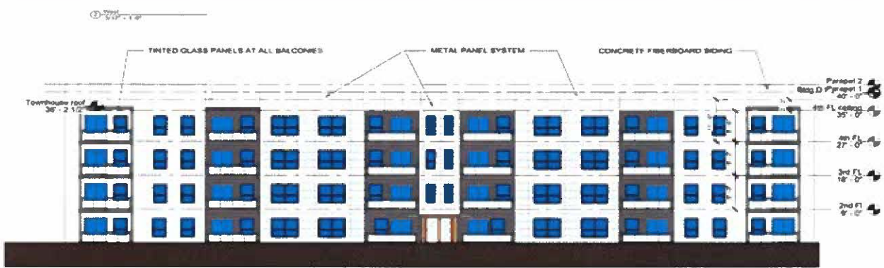
North - Bag D