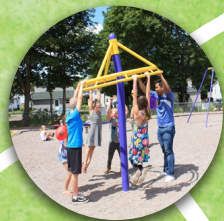
Amherst Lions Park