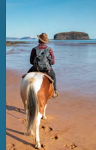
Spirit Reins Ranch