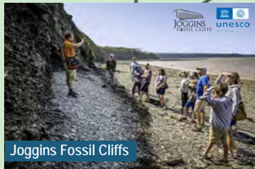
Joggins Fossil Cliffs