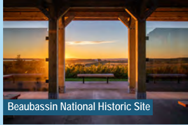
Beaubassin National Historic Site