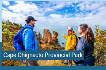
Cape Chignecto Provincial Park