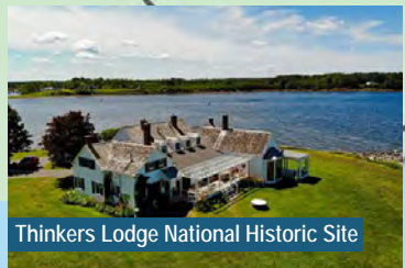
Thinkers Lodge National Historic Site