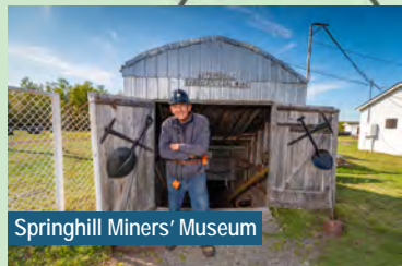
Springhill Miners' Museum