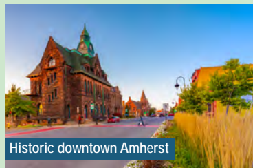
Historic downtown Amherst