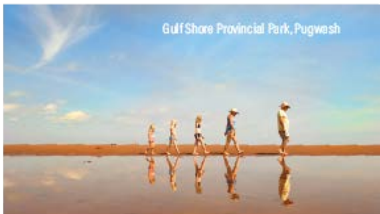
Gulf Shore Provincial Park, Pugwash