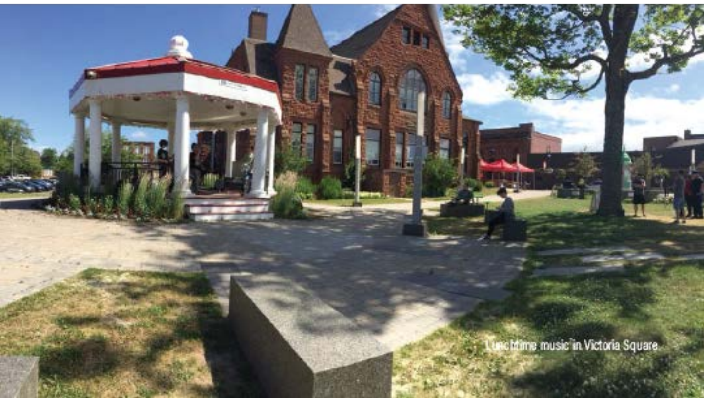
Livetime music in Victoria Square

But if you like the idea of small town living with cozy cafés, pubs that serve up local craft beer and live music and a vibrant arts and recreation culture, then Amherst might just be the town for you. As the second-largest small town in Nova Scotia, we have lots to offer our 9,400 residents and the 100,000 other people who live within a half-hour drive. And when the open road calls, we're ideally located in the geographic centre of the Maritime provinces. An international airport and the urban centre of Moncton are just over half an hour away. So, come see why we love it and make Amherst your hometown too!