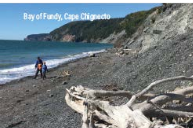
Bay of Fundy, Cape Chignecto

Imagine driving to the ocean after work to breathe in the salty ocean air. We're the "host to two coasts"! With ancient fossils and impressive tides, the Cliffs of Fundy UNESCO Global Geopark is just down the road to the south. The sandy beaches and warm waters of the Northumberland Strait are only 22 minutes to the north. There you can sea kayak or comb the strait's many beaches for sea glass. In between, you'll find mountain waterfalls, salmon rivers and wild blueberry fields. Beautiful blue skies, fresh air and sunny days are in the forecast all summer long!