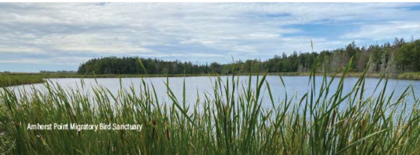
Amherst Point Migratory Bird Sanctuary