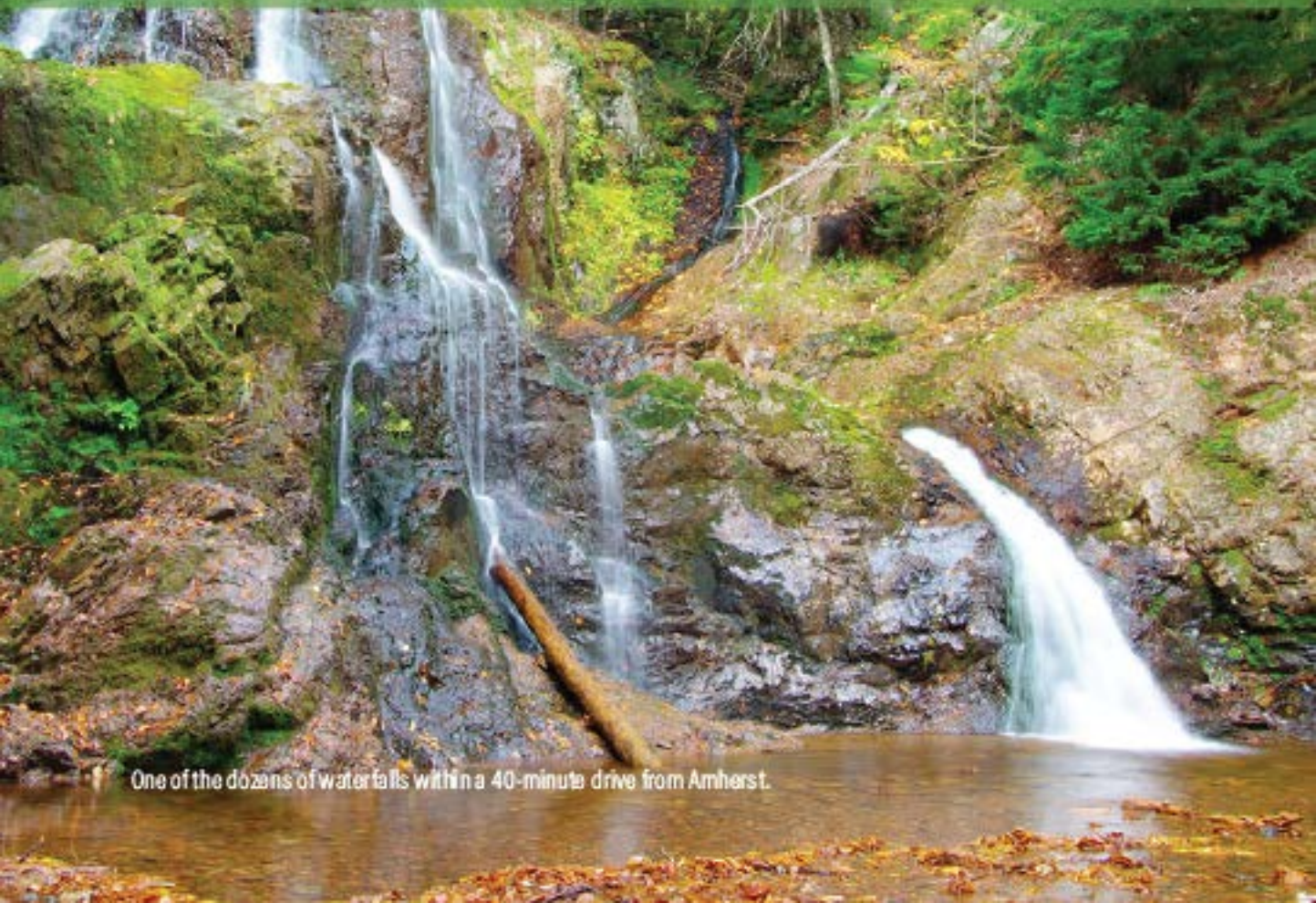
One of the dozens of waterfalls within a 40-minute drive from Amherst.